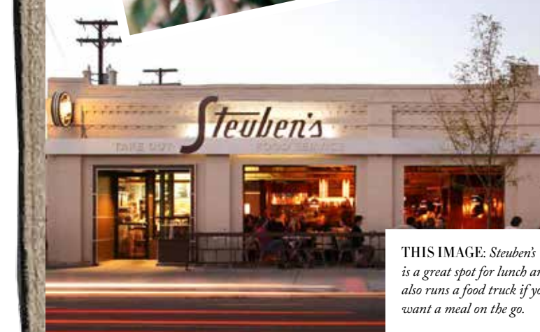
THIS IMAGE: Steuben's is a great spot for lunch and also runs a food truck if you want a meal on the go.