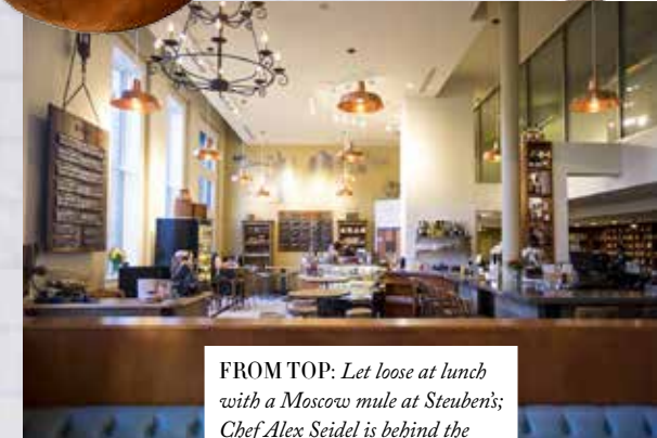
FROM TOP: Let loose at lunch with a Moscow mule at Steuben's; Chef Alex Seidel is behind the excellent Mercantile; Denver is very much an outdoors city with nearby parks easy to explore; The famous Red Rocks Amphitheatre.