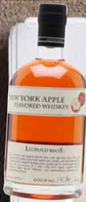
FROM LEFT: Try local spirits at Williams & Graham; The Clyfford Still Gallery; The gallery's minimalist exterior.