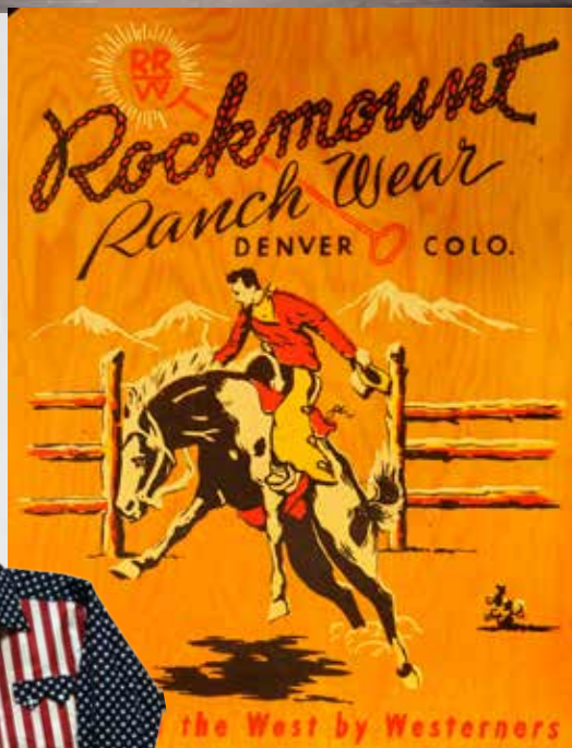
ABOVE AND LEFT: Grab a cowboy shirt at Rockmount Ranch Wear, which clothed Heath Ledger in Brokeback Mountain .